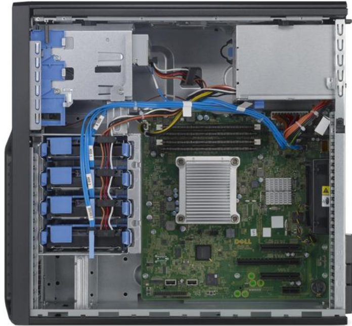
Figure 4. Internal-Chassis View

Figure 4 shows the internal-chassis view of the PowerEdge T110 II.