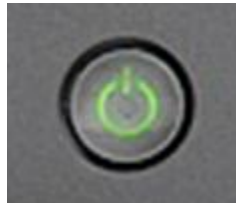
Figure 5. Power Button

All Dell PowerEdge servers have a green LED integrated in the power button which indicates the system's power state. Figure 5 shows the power button.