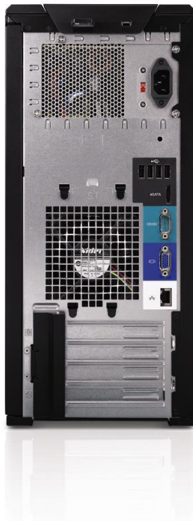
Figure 3. Back-Panel View

Figure 3 shows the back-panel view of the PowerEdge T110 II.