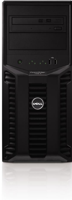
Figure 2. Front-Panel View

Figure 2 shows the front-panel view of the PowerEdge T110 II.