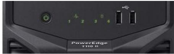
Figure 6. LED Control Panel

Figure 6 shows the LED control panel located on the front of the T110 II system.