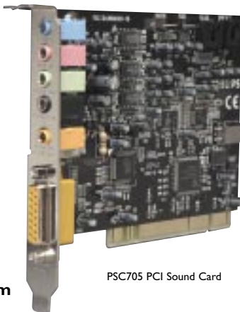
PSC705 PCI Sound Card

Create your own music. Sonic Foundry's Acid Xpress software is the new standard in loop-based music production. Work with hundreds of pre-recorded loops to mix your own music.